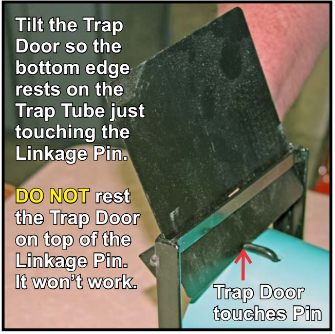
#4. Rest Trap Door on Trap Tube