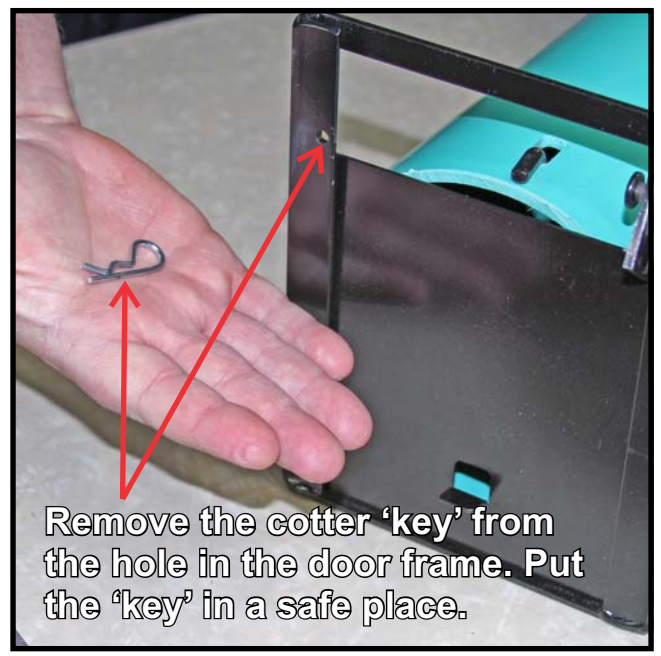
#2. Pull the Cotter Key