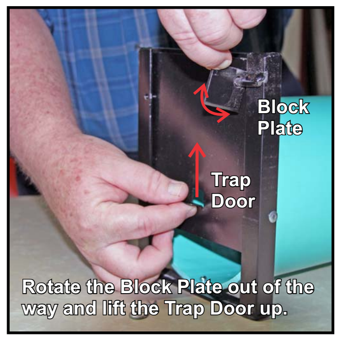
#3. Lift the Trap Door