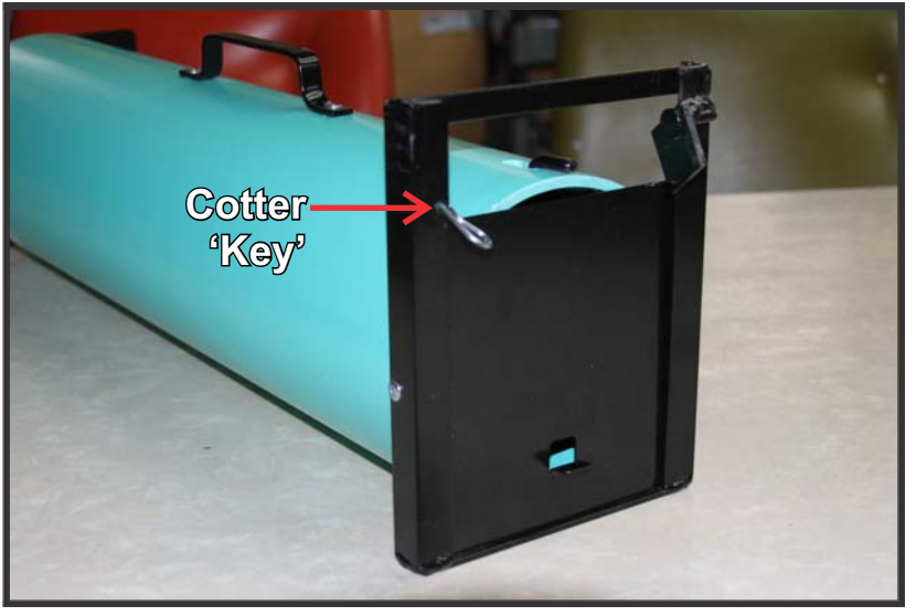
#7. Put Cotter Key in hole to lock the Trap Door when transporting an animal in trap

IMPORTANT NOTE: Having the best trapping equipment does not guarantee trapping success. Bird and animal trapping can be as much art as it is science and you might not catch anything. Effective trapping takes careful planning, a knowledge of the target species, the correct bait, trap location and more.